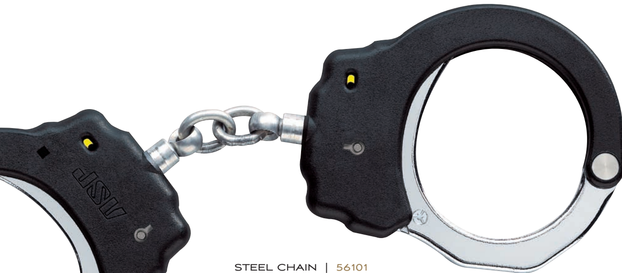
STEEL CHAIN | 56101

The frame geometry, deep set teeth and precision smooth action eliminate the need for backloading. Lock Assemblies are readily replaced.