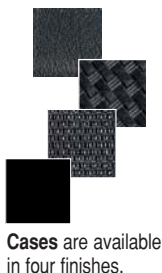
Cases are available in four finishes.