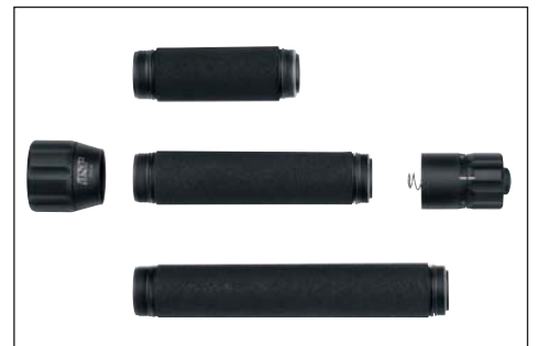
Power Cell Tubes extend the run time of Triad® lights.