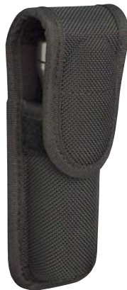
SideBreak® and Duty Cases protect and securely retain the Triad.